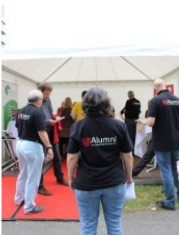
© Alumni der Universität Bremen e.V.