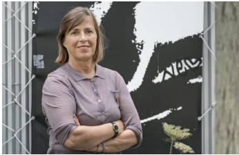
© Alumni der Universität Bremen e.V.