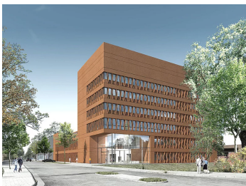
© Haslob Kruse+ Partner Architekten BDA