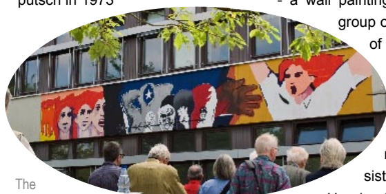
The Ambassador also visited the Mural at GW1