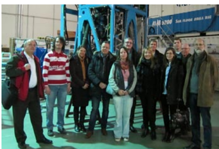
The participants of the MARUM visit.

T he new series, „Networking by, for and with alumni 2015“ from community bremen e.V. had a successful start with a tour of the Zentrum für Marine Umweltwissenschaften (Center for Marine Environmental Sciences), for short,