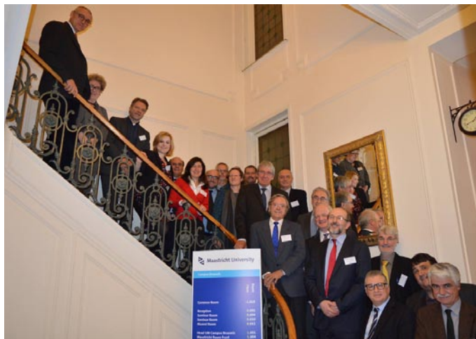
The representatives of nearly 20 outstanding European research universities met in Brussels in January.

At the beginning of January, nearly 20 universities from all over Europe met in Brussels. All universities had one thing in common: All of them were founded less than 50 years ago and have meanwhile developed into exceptional universities which is evidenced by their corresponding placements in the relevant university ranking lists.